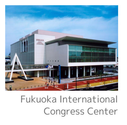
Fukuoka International Congress Center